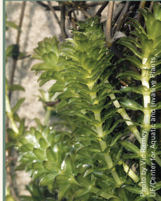
Hydrilla Hydrilla verticillata

Watch out for these invaders! These invasive aquatic plants are prohibited in Wisconsin.